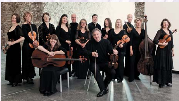
THE ACADEMY OF ANCIENT MUSIC