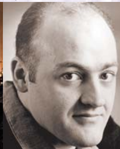
BBC CONCERT ORCHESTRA