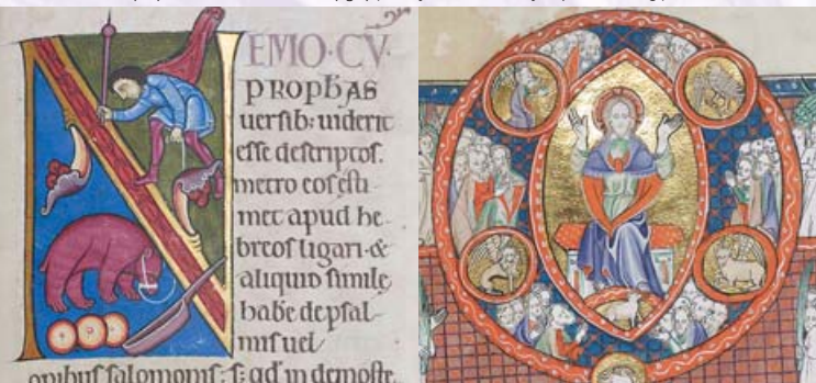
THE BURY BIBLE (left), ST AUGUSTINE'S GOSPELS (right)