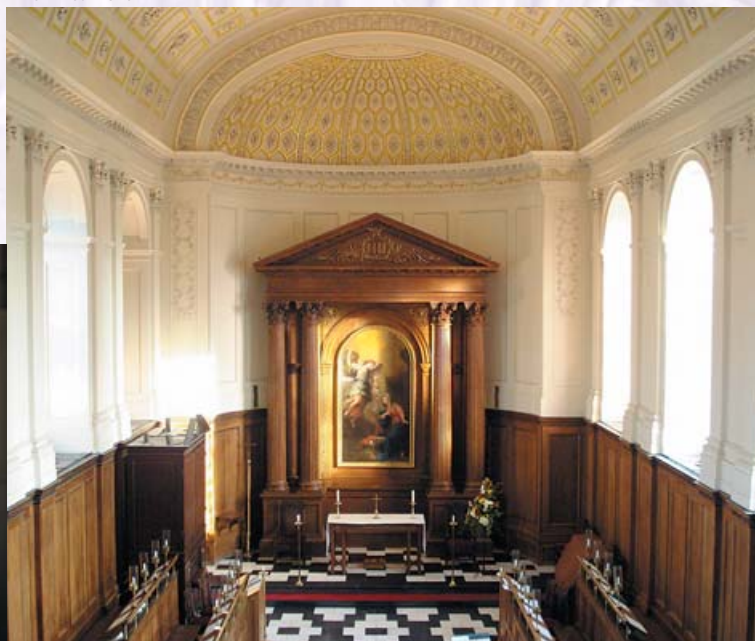
CLARE COLLEGE CHAPEL