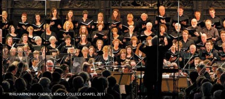
PHILHARMONIA CHORUS, KING'S COLLEGE CHAPEL, 2011